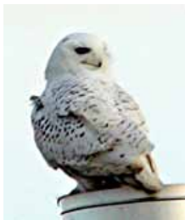
Snowy owl

A SNOWY OWL became Colorado's ultimate backyard bird. Spotted in late December in Prairie Vista subdivision northeast of Colorado Springs, the owl has thrilled hundreds of observers into February. A breeder in the Arctic tundra, it's probably the most photographed bird in the State's history. Its selected subdivision has 5-acre lots, short grass, and a few horses. It favors rooftops for daytime perches (a real House-List bird) and allows close approach.