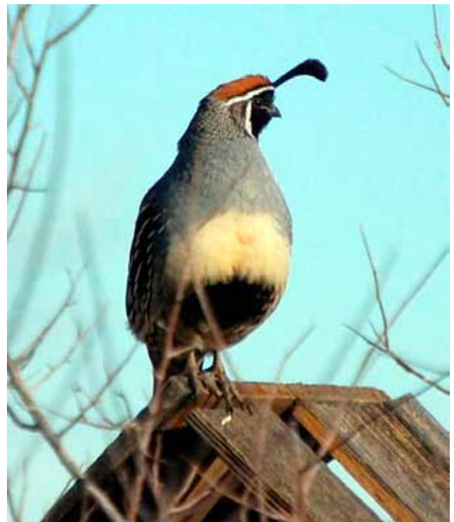
Gambel's Quail from Birding the Bosque Del Apache

As ever, if you want to read the bills themselves or get other information about the legislature, you can go to www.leg.state.co.gov for more information. You can also get on Colorado Audubon's alert list by contacting them: www.coloradoaudubon.org .