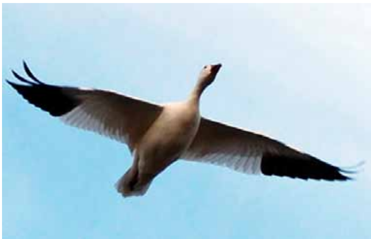
Snow Goose from Birding the Bosque del Apache

Hors d'oeuvres and sweets, wine and beer, and non-alcoholic beverages will be served.