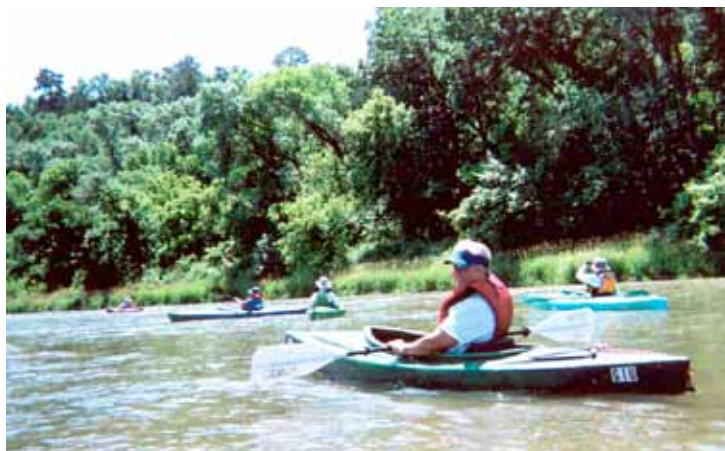
ASGD members enjoy kayaking the Niobrara River in Nebraska.

DESCRIPTION: Audubon Master Birder candidates will lead a carpooling trip to Chico Basin Ranch, an 87,000-acre working cattle ranch 35min southeast of Colorado Springs. Well known to birders as a migrant trap, 5 ponds and riparian and spring-fed streams attract migrating warblers, waders, and waterfowl. Bill Maynard, Chico Basin Ranch birding expert, will lead the group to discover local rarities, best seen early in the morning. RMBO banding station may be visited. Dress for variable weather, and bring a lunch, binoculars, scopes, and field guides.