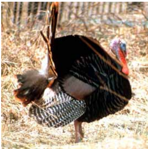
Wild Turkey