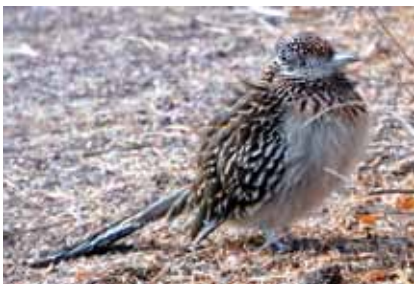
Greater Road Runner from Birding the Bosque Del Apache

DESCRIPTION: We'll walk along the East Plum Creek trail through riparian habitat featuring Cooper's Hawk, three swallow species, Blue Grosbeak, and Lesser Goldfinch (of course, in April, only the hawk can possibly be there). Learn the rudiments of Atlas bird watching – a new and more interesting way to observe bird behavior. Learn Atlas techniques to adopt your own Atlas Block or help survey the ASGD blocks.