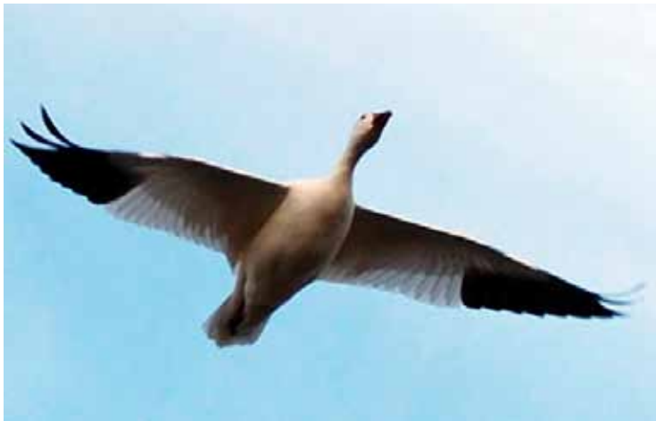
Snow Goose from Birding the Bosque del Apache

Hors d'oeuvres and sweets, wine and beer, and non-alcoholic beverages will be served.