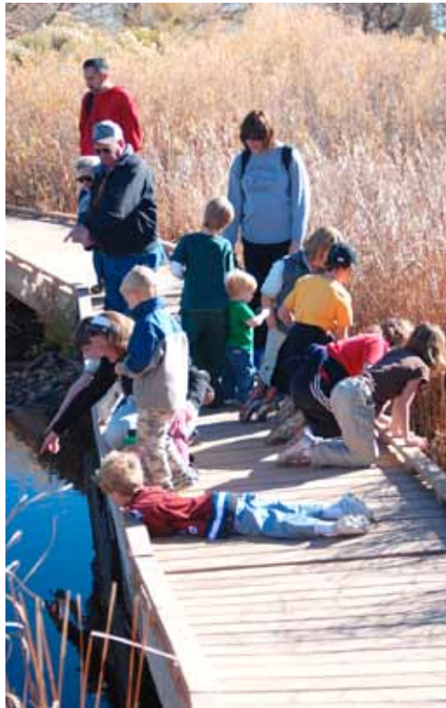
Young and old alike enjoy the outdoor learning opportunities at the Audubon Nature Center at Chatfield State Park.