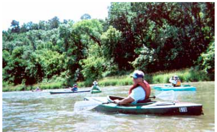
ASGD members enjoy kayaking the Niobrara River in Nebraska.

DESCRIPTION: Audubon Master Birder candidates will lead a carpooling trip to Chico Basin Ranch, an 87,000-acre working cattle ranch 35min southeast of Colorado Springs. Well known to birders as a migrant trap, 5 ponds and riparian and spring-fed streams attract migrating warblers, waders, and waterfowl. Bill Maynard, Chico Basin Ranch birding expert, will lead the group to discover local rarities, best seen early in the morning. RMBO banding station may be visited. Dress for variable weather, and bring a lunch, binoculars, scopes, and field guides.