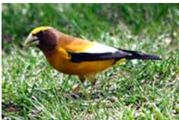
Evening Grosbeak