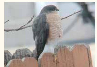
Swainson's Hawk by Bea Weaver

Randy saw “a kettle of seven Turkey Vultures May 7 flying high over the open space. Shortly after, I noticed some very large birds soaring around the yard next door and our yard. Running to the window, suddenly I find that there are seven TV’s roosting in the neighbor’s cottonwood tree! They spent the night there and this morning we watched them warm up their wings in the sun, then they flew a few test laps around the greenbelt before taking off to the north again. I never thought a spectacle like that would happen right next door.”