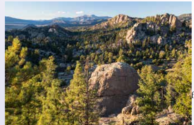
Brown's Canyon Nat'l Monument

The LWF was established to fund research and education projects “designed to lead to the conservation of non-game species in Colorado.” It is dependent on our friends. We hope you will join us in supporting these scientists and