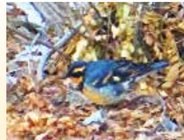
Varied Thrush by Becky Campbell

April 2, Kathie Moses "noticed the Western Bluebird pair that has been inspecting my bird boxes were in a tizzy. When I watched to see what the fuss was all about, I spotted a Violet-green Swallow flying far too close (according to the bluebirds) to one of the boxes. Time for the nest box wars to begin."