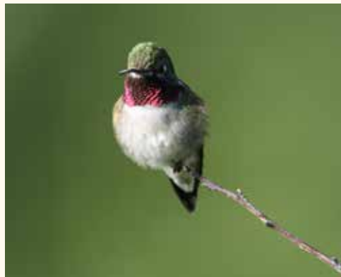
Broad-Tailed Hummingbird