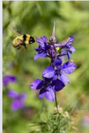
Bumblebee

The Lois Webster Fund (LWF) of the ASGD announced the projects selected to receive grants for Colorado Nongame Wildlife Education and Research in 2016 at the Annual LWF Program on May 4 th . Twelve excellent applications for grants totaling over $32,627 were received by the LWF this year. The LWF agreed to fund three of these project requests for a total of $5,715. The LWF Committee members were very impressed with the quality and significance of this year's applications. The grantees included both research and education initiatives with a variety of partnerships and projects that will have an impact on the conservation of Colorado's nongame wildlife.