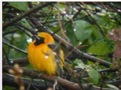
Hooded Oriole by John Ealy

From Parker, Randy Nelson reported the next one, April 14 at 6:30 p.m. On April 17 he reported, “It made it through the snowstorm and continues to visit the feeders all day today. I had to change out the nectar feeders every 2 hours since the blowing snow covered the feeding ports even on the covered deck. Lots of drifting but looks like 20 inches plus in the yard. A new male broad-tail arrived about 4 p.m. April 17 and fed frequently at the deck feeder. I’ve been told that the hummer migration is dependent on weather, native flowers and insects, so I think the golden currant and paintbrush, etc. must be helping out along with the overdue warming.”