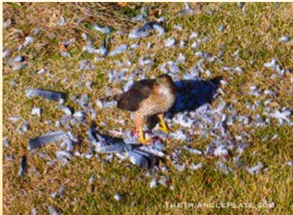
Cooper's Hawk with feathers