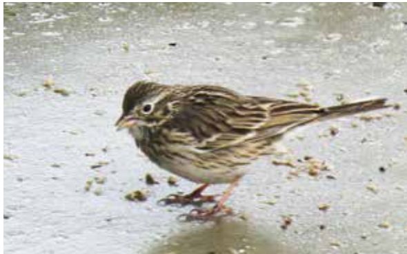
Vesper Sparrow by Pam Zimmer

You don't need a marsh. From Longmont Jamie Simo reports: "On April 5 when I went out to bring in our milk delivery I was startled by a