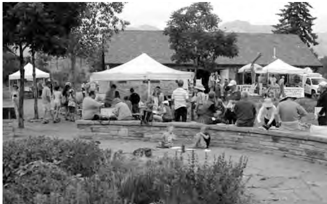
Over 500 visitors enjoyed the beautiful day and nature at its best at the The first annual Audubon Nature Festival.

The first annual Audubon Nature Festival and FUNdraiser held on Sunday, June 7 was a great success! Groups of all ages came as families or with friends to enjoy the beautiful day and nature at its best. Over 500 visitors helped the Audubon Society of Greater Denver celebrate its 40th anniversary.