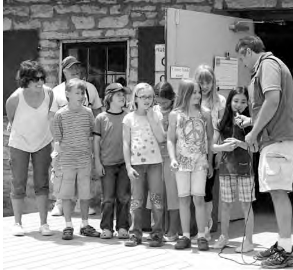
Birdathon team from Rick's Center for Gifted Children at the University of Denver receiving award as top student team in 2009