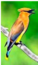
Cedar Waxwing, Photo by Dick Vogel

DENVER , noticed, on May 25, "some very noisy chattering birds in the back yard. I took a peek and saw MANY birds flitting back and forth in low and high branches. They ducked and dove, landing frequently but taking off quickly. I sent a note with pictures to a few friends asking what they were. Only one taker – Cedar Waxwings. A whole big flock. 50, 60, perhaps 80, lots and lots. I've never seen this particular beauty in the 28 years I've lived here."