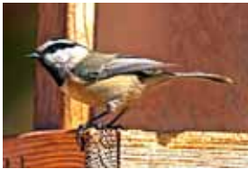
Mountain Chickadee

GINA GERKEN , raking sticks in her Castle Pines yard, “uncovered the body of a badly decomposed rabbit. I noticed a Mountain Chickadee watching me rake. A couple of times it flew down to the pile of sticks; seconds after uncovering the rabbit I walked away. The chickadee was on the rabbit corpse wildly pulling out fur. I watched for 30 seconds. With a mustache-like load of fur, it flew off to its box to line its nest. It’s the little things in life that bring me joy!”