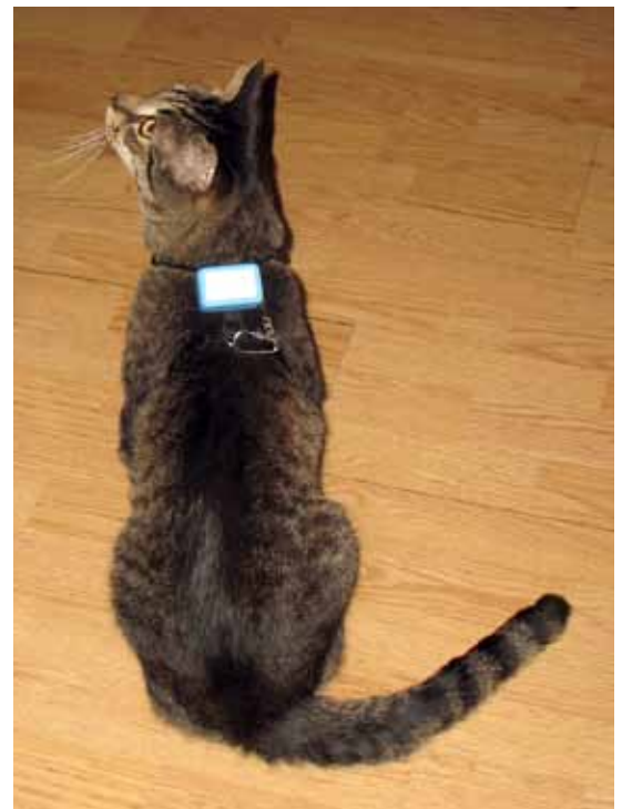
Kink the Cat