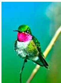
Broad-tailed Hummingbird, Photo by Dick Vogel

JEFF STROUP, IN LITTLETON , went out to pick up the morning newspaper. “I was surprised to see a hovering hummingbird zipping around our front yard, especially around our large oak tree. Then I saw it sitting in a nest, about six feet off the ground on the lowest horizontal tree limb. Every once in a while I look out the window and 90% of the time, she’s sitting there peacefully.” On June 30, “Good news. We have two newborn Broad-tailed Hummingbirds in the nest. Last night I climbed up using a stepladder and with a flashlight saw both of them. Wiggling fuzzballs.”