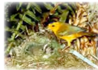
Wilson's Warbler.

KAREN METZ WROTE , "The short micro-sprinkler system for my perennials garden lures birds in to bathe. Last week the bathers included migrating Orange-crowned, Tennessee, and Wilson's warblers. And today, first under the sumac berries and then in a birdbath within a garden bed – an Ovenbird! Leaves of the larger plants, such as Boulder raspberry, are where most of the small birds bathe, and the hummingbirds also find the leaves of the 'red birds in a tree' to be a fitting size. Migrants need to keep their feathers in clean and healthy form for maximum flight efficiency."