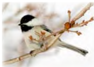
Black Capped Chickadee.

BIRDS: Patti and Scot Locke discovered a bird roosting on their patio. They couldn't quite ID it until it moved to a new place in the front of their house. Scot's photo clinched the ID – a Black-capped Chickadee. Last winter in Golden, Sandy Dusdal watched flickers clinging to the brick side of her house all night.