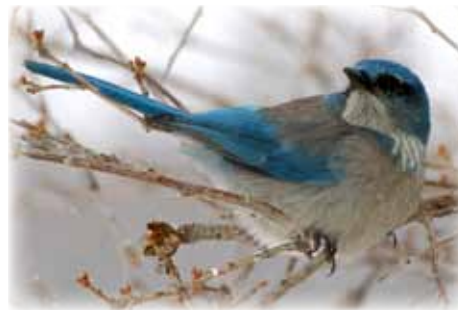
Can you find the western scrub jay in Hugh Kingery's Backyard Birds article on page 9 and 10?

I WELCOME YOUR CONTRIBUTIONS to this column. Send a note or post card to P.O. Box 584, Franktown 80116, or Email me: ouzels8@aol.com .