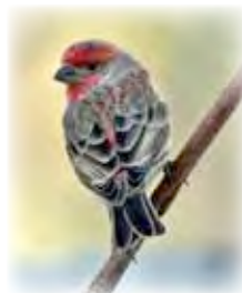
House Finch.

AND FINALLY, THE SICK FINCH REPORTS. All over the metro area people see sick House Finches or Pine Siskins. First rule for feeders: clean them every couple of weeks with a diluted bleach solution. Second, if you continue to see sick birds, stop feeding for at least two weeks. Bird diseases spread when birds feed in close proximity to each other. Stop feeding, disperse the flocks, and when you resume they will find you again – eventually.