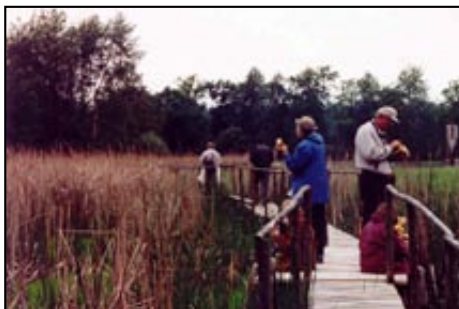
ASGD birders walk through wetlands on a boardwalk during 2002 Czech trip.

Flights arrive in Ostrava on May 17 and departs from Prague on May 26. Register by calling 303-973-9530. Cost for Denver Audubon members is $1,400 per person, double occupancy; $1,500 per person, single occupancy. (Non-members add $100.) A deposit of $200 is due at time of registration with the balance due by March 16, 2005. Price includes hotel accommodations and meals while in the Czech Republic. Price does not include air fare, alcoholic drinks or departure taxes. For assistance in booking flights and/or travel insurance, please contact Becky Beckers at 303-766-5266 or agentbecky@aol.com . (Currently airfares from Denver to Ostrava are around $870 round trip.)